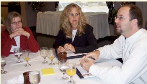
Sharing ideas at the Leadership Learning Laboratory

RISE 2020 is a cultural framework for rural development that capitalizes on these connections. Its ultimate goal is to make rural communities great places to live, learn, work, and play. RISE 2020 is a 15-year effort owned by Indiana’s rural citizens, community leaders and service providers – an inclusive initiative that is driven by the people who get involved. RISE 2020 is an exciting opportunity to help local people do great things.