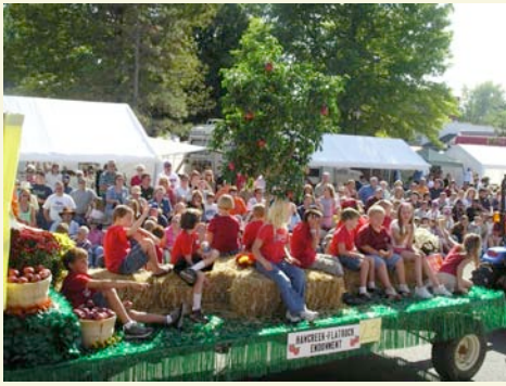
Celebrating the Apples to Orchards Project in Hope